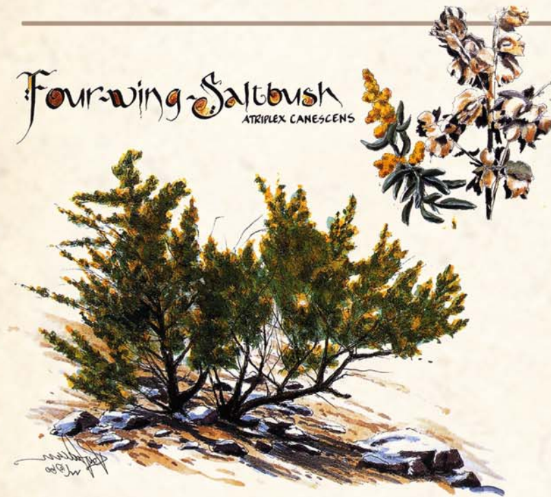
Four-wing Saltbush ATRIPLEX CANESCENS