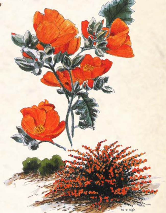
Globe Mallow SPHAERALCEA AMBIGUA