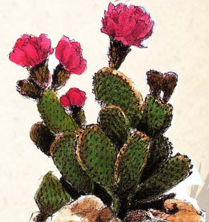
Beavertail Cactus OPUNTIA BASILARIS