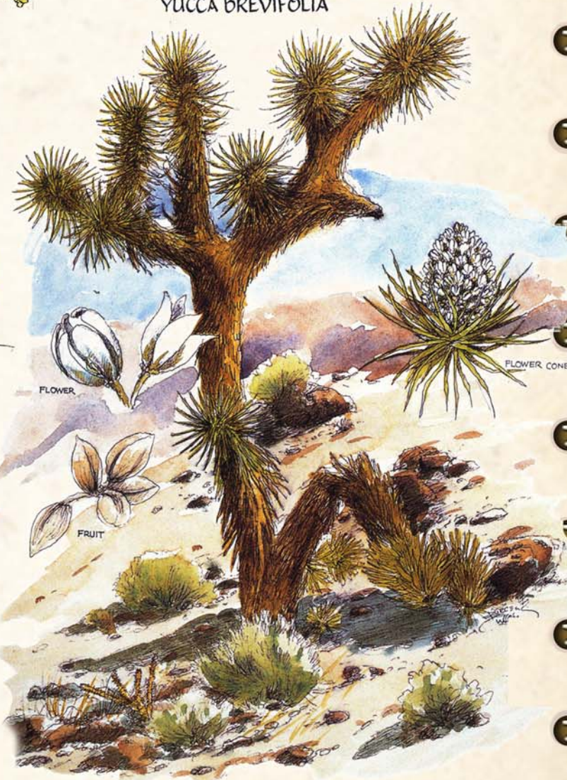
Joshua Tree YUCCA BREVIFOLIA

Joshua trees grow naturally between 2,000 and 6,000 feet in elevation and only in the Mojave Desert. They are among the many desert plants that have spectacular flowers when conditions are just right.